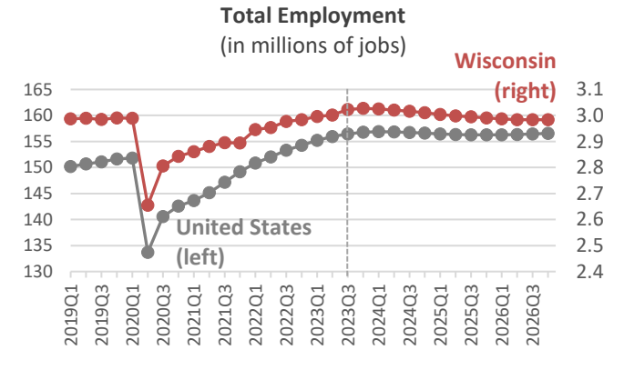
Sources: Bureau of Labor Statistics (CES) and Wisconsin DOR (forecast).

Wages and salaries are expected to increase 5.0% in Wisconsin and 5.3% in the US in 2023, following growth of 8.0% and 8.8% in 2022, respectively. The outlook for 2024 expects another year of positive although slower wage growth in Wisconsin (3.8%) and nationwide (4.7%). The Fed's policy of higher rates will slow employment growth while lowering inflation, bringing growth of wages and salaries, and personal income, down too.